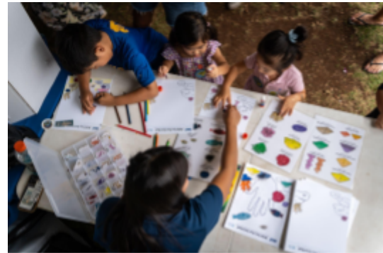
World Ocean Day outreach event at Waikīkī Aquarium