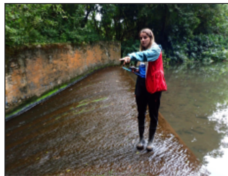
Manatee Mudflower survey from Nuʻuanu Stream area 6