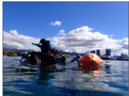
AIS field team member prepares for a dive to monitor coral outplants