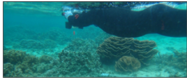
SfM monitoring of an invasive M. foliosa colony