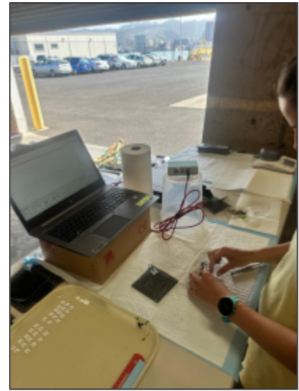
AIS team members performing desiccation trials