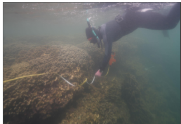
Measurement of vessel scar from P3 in Kāneʻohe Bay