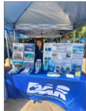
AIS staff running a booth at Malama Pūpūkea World Ocean Day