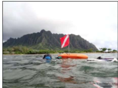
Soft coral surveys from Kualoa Beach Park