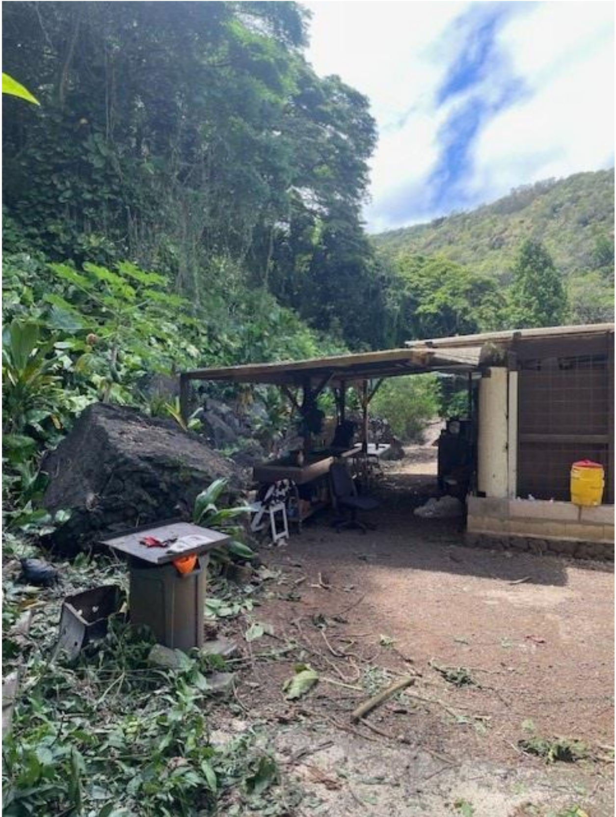
Photo 2. Facing east at the location of the rockfall mitigation behind the Community Resource Center