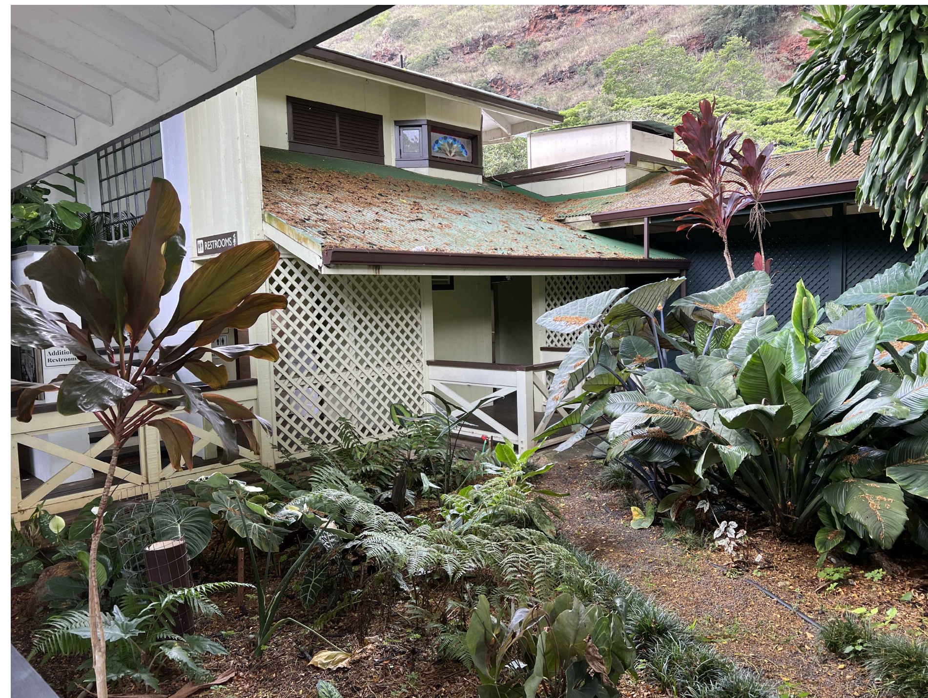
VISITOR CENTER RESTROOMS