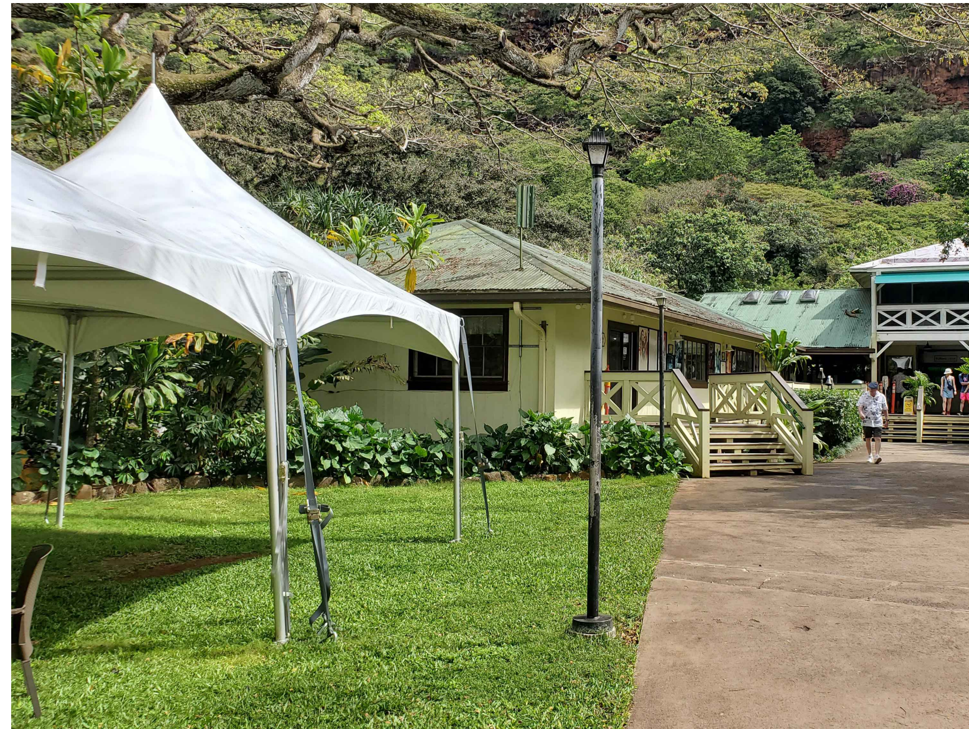
VISITOR CENTER GIFT SHOP