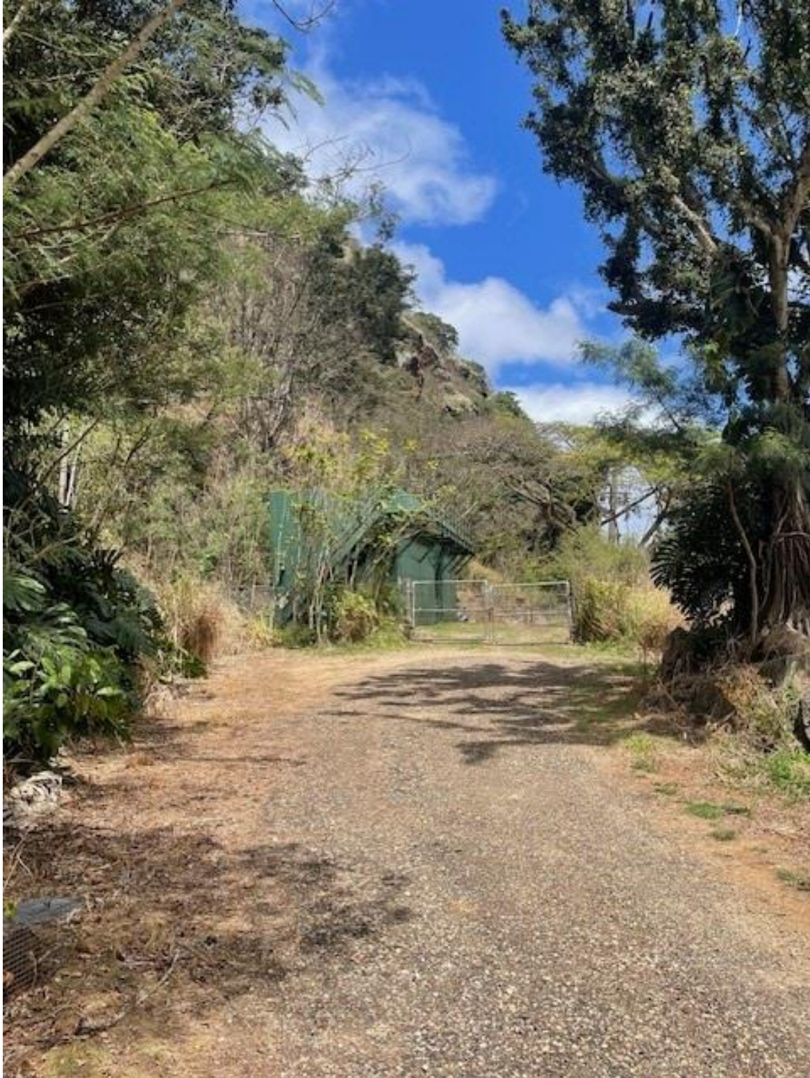
Photo 4. The pathway leading to the STP area showing the existing STP. The Future STP will be located between the photographer and the fence.