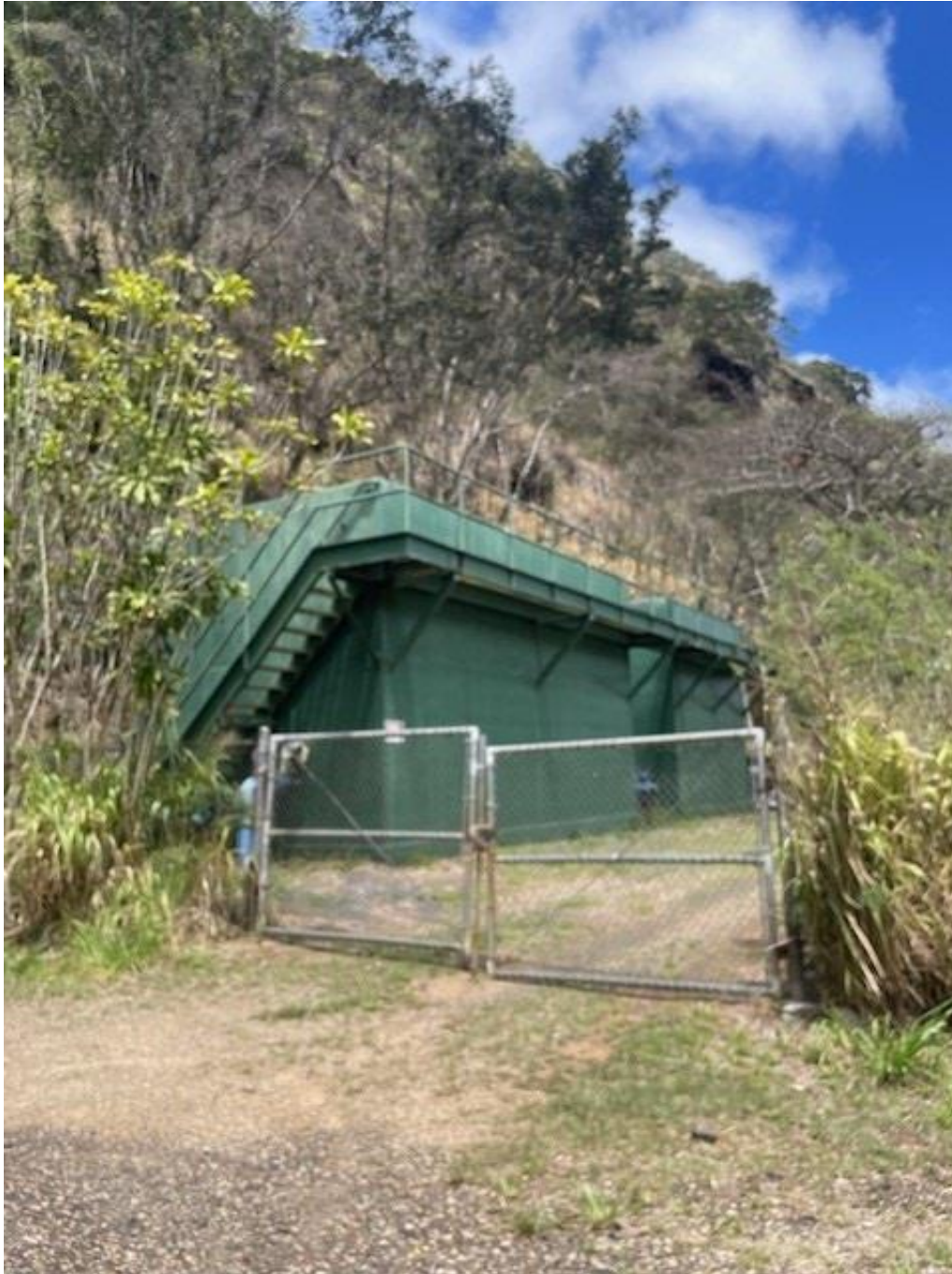
Photo 4. Facing south at the existing Sewer Treatment Plant (STP) area.