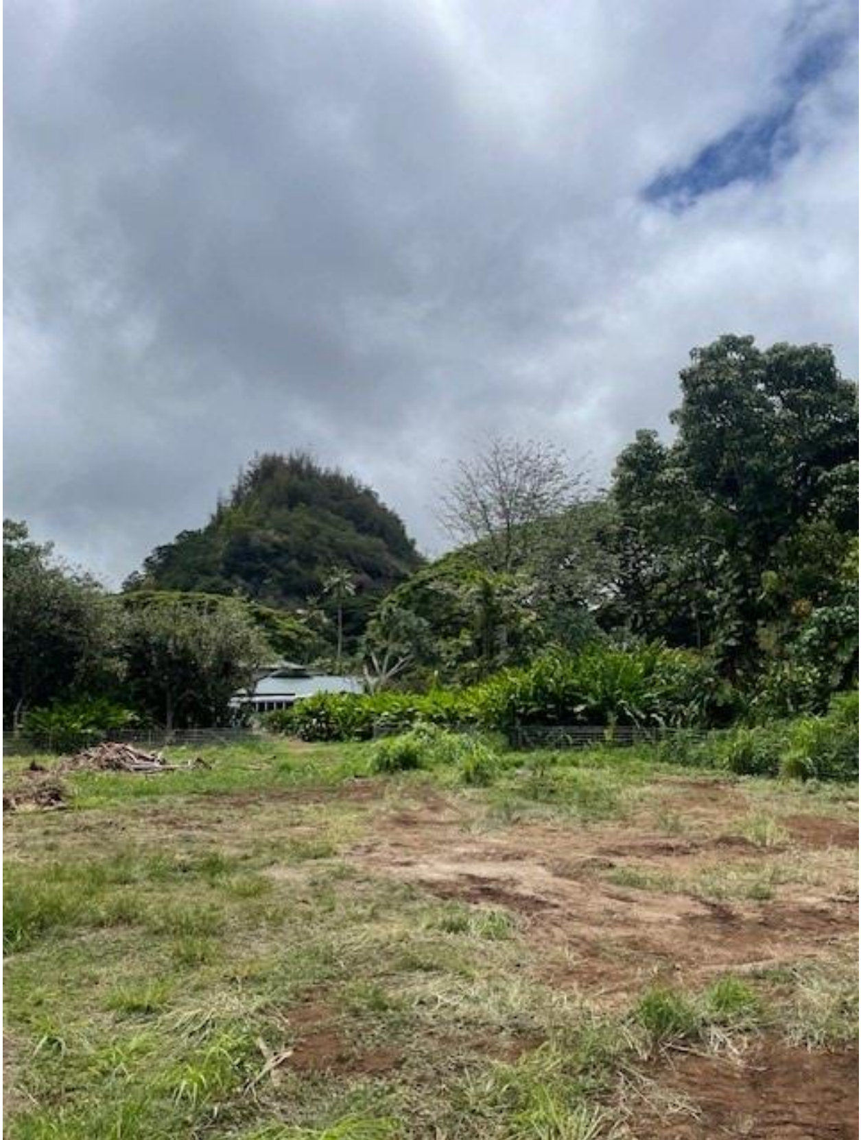
Photo 1. The Pu'ukua Lot, at the Traditional Hawaiian Hale location. Looking east into the valley.