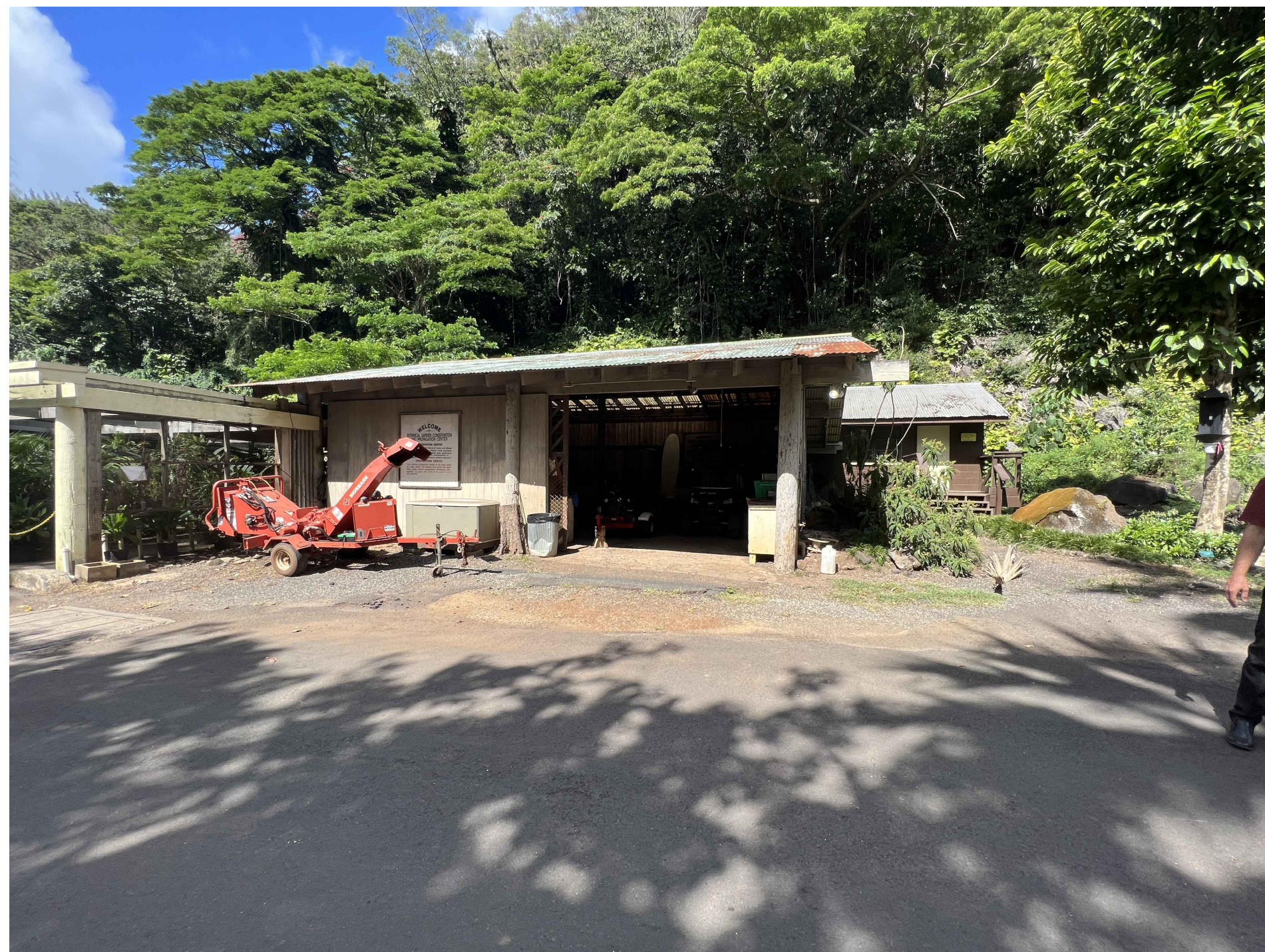
COMMUNITY RESOURCE CENTER