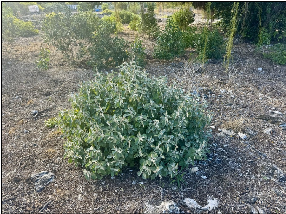
Figure A-6. A round-leaved chaff flower plant that was planted in February 2023 at Kalaeloa Heritage Park. Photograph taken on February 23, 2024.