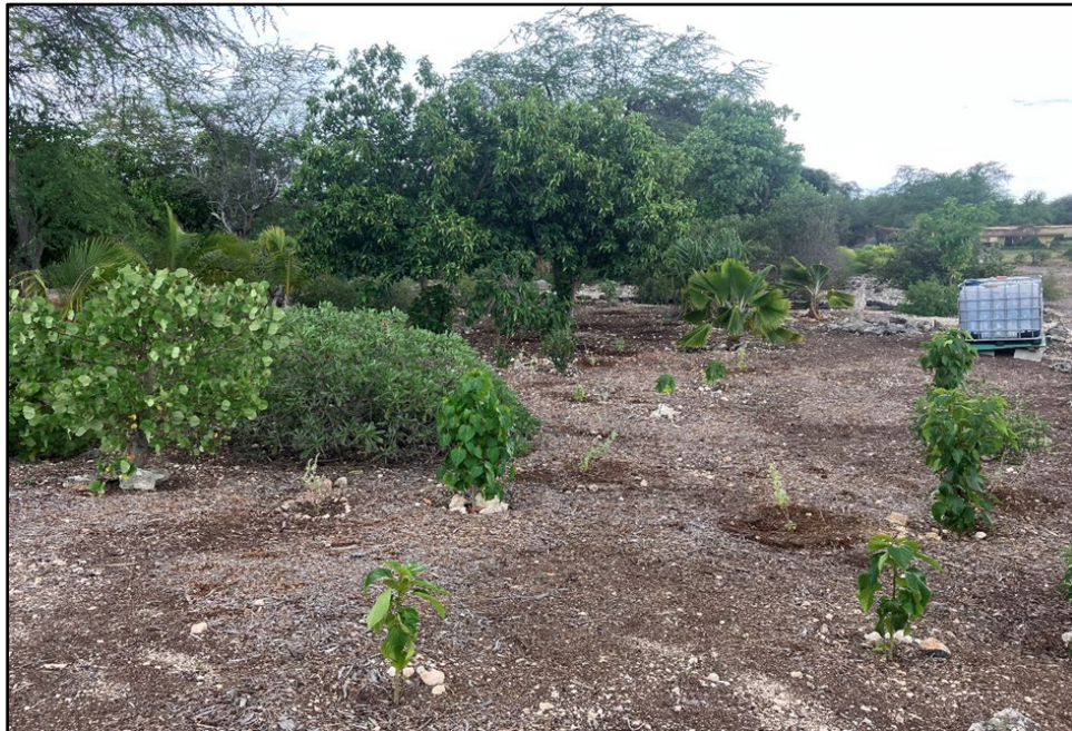
Figure A-2. Newly planted round-leaved chaff flower plants at Kalaeloa Heritage Park, February 2, 2023.