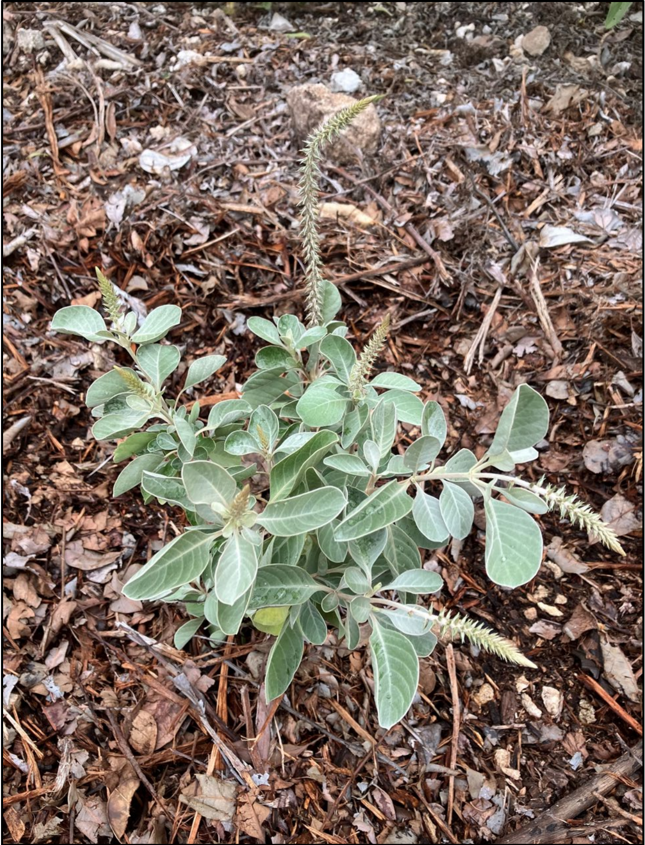
Figure A-3. A newly planted round-leaved chaff flower plant at Kalaeloa Heritage Park, February 2, 2023.