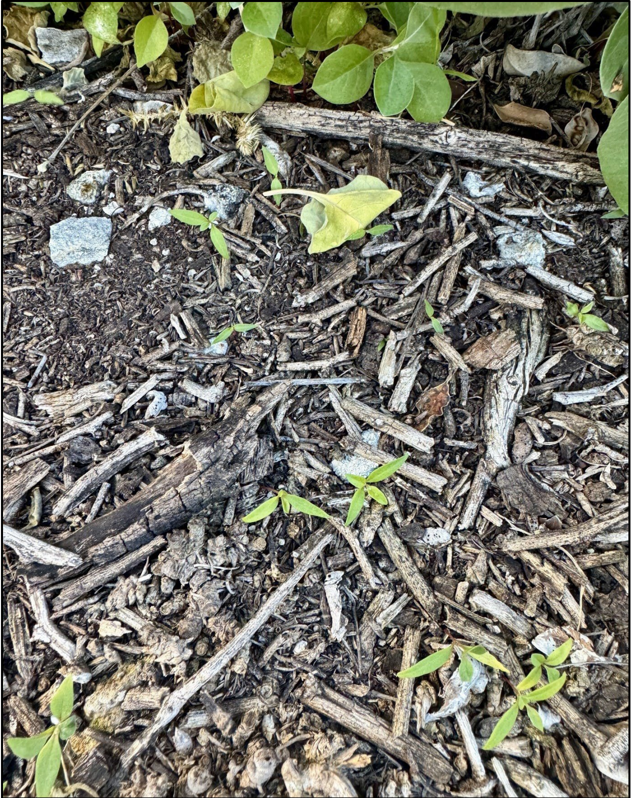
Figure A-9. Seedlings of round-leaved chaff flower plants. These seedlings germinated from seed produced by parent plants that were planted in February 2023 at Kalaeloa Heritage Park. Photograph taken February 23, 2024.