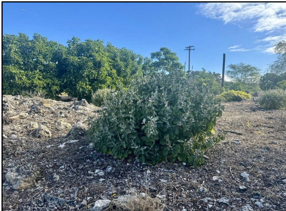
Figure A-8. A round-leaved chaff flower plant that was planted in February 2023 at Kalaeloa Heritage Park. Photograph taken February 23, 2024.