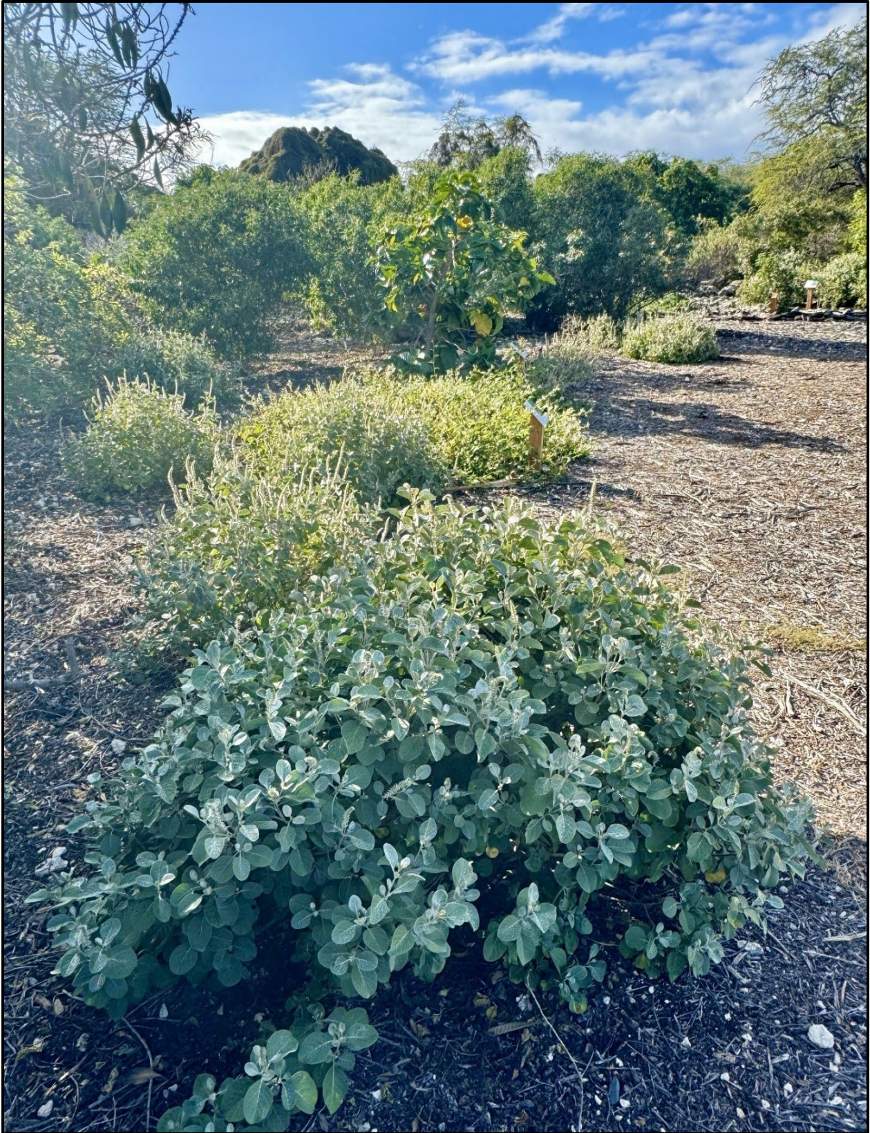
Figure A-4. Round-leaved chaff flower plants that were planted in February 2023 at Kalaeloa Heritage Park. Photograph taken on February 23, 2024.