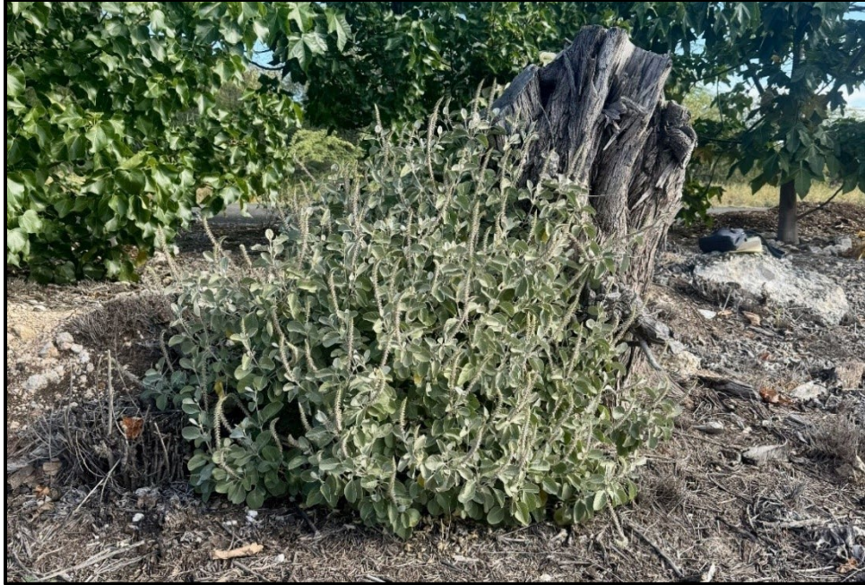
Figure A-5. A round-leaved chaff flower plant that was planted in February 2023 at Kalaeloa Heritage Park. Photograph taken on February 23, 2024.