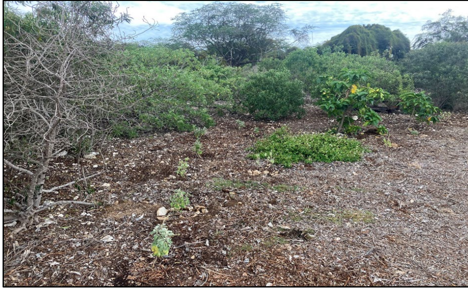
Figure A-1. Newly planted round-leaved chaff flower plants at Kalaeloa Heritage Park, February 2, 2023.