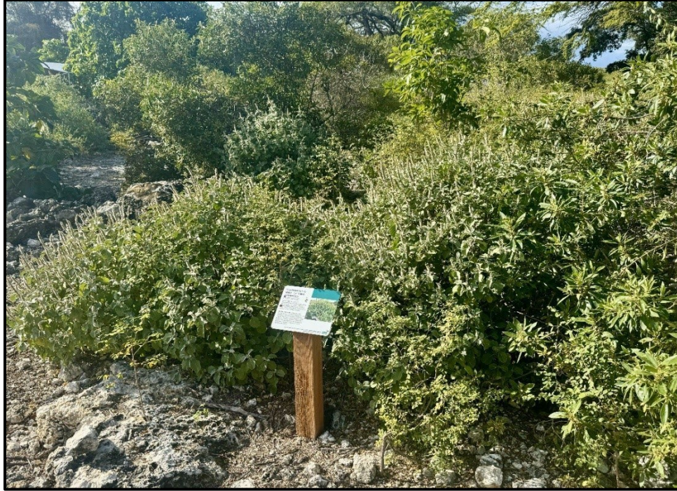
Figure A-7. Round-leaved chaff flower plants that were planted in February 2023 at Kalaeloa Heritage Park. Photograph taken February 23, 2024.