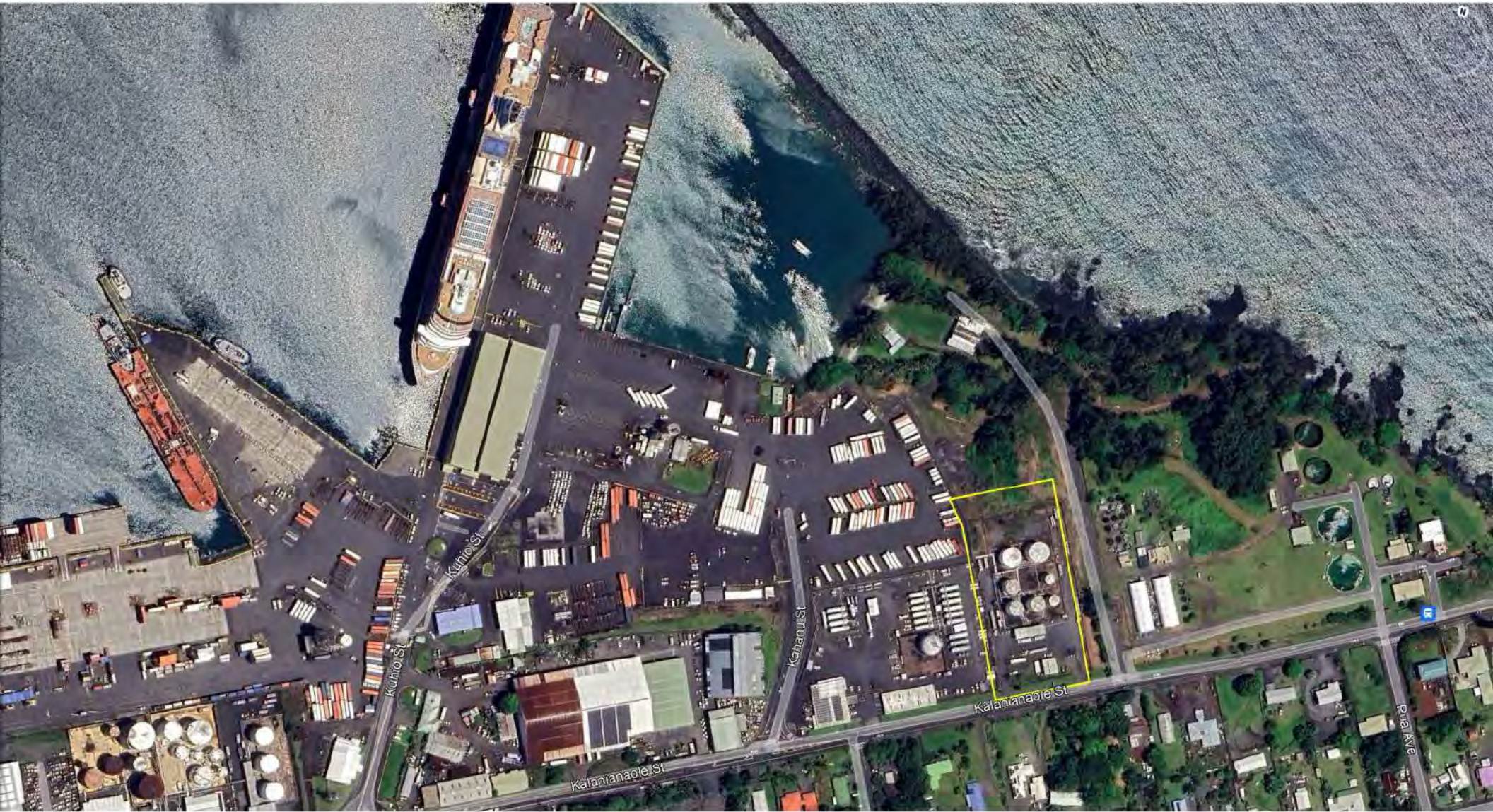
Exhibit B Final Inspection GLS-5187