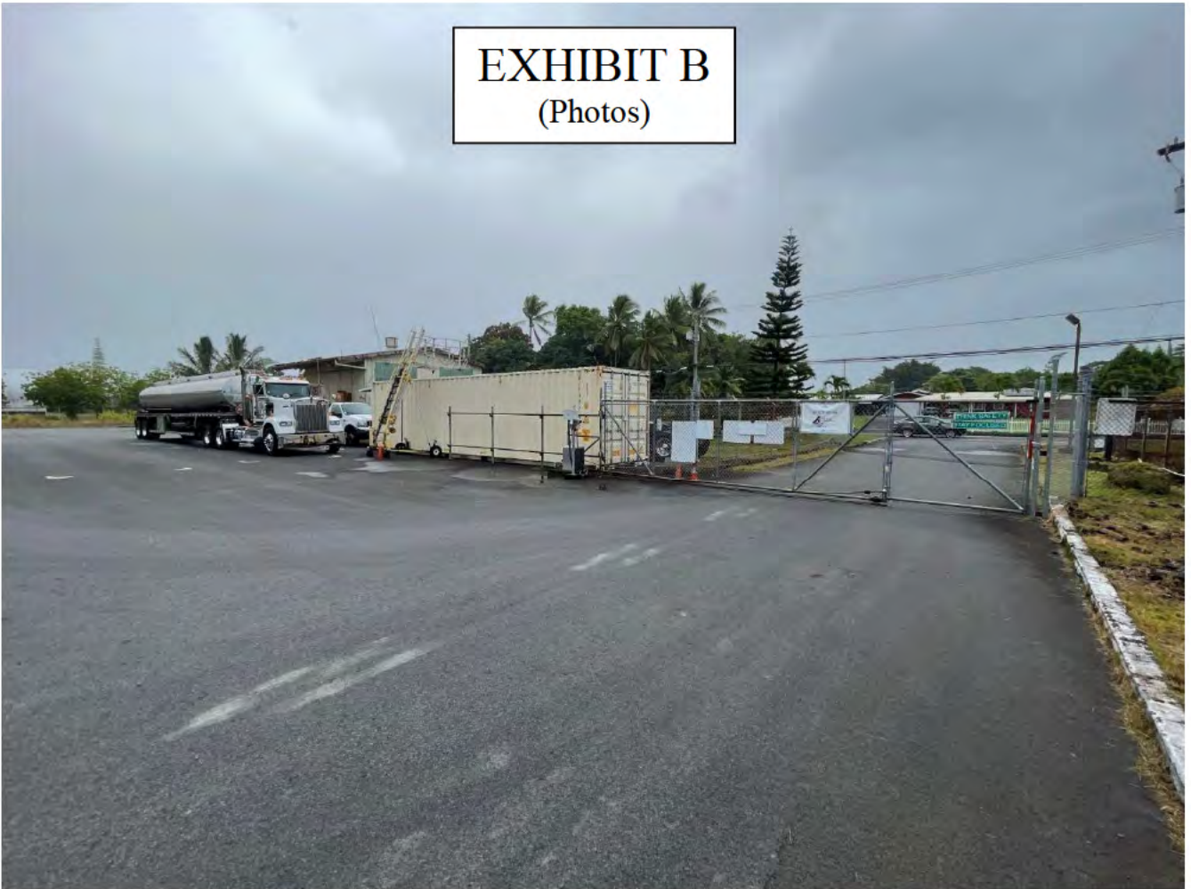
EXHIBIT B (Photos)