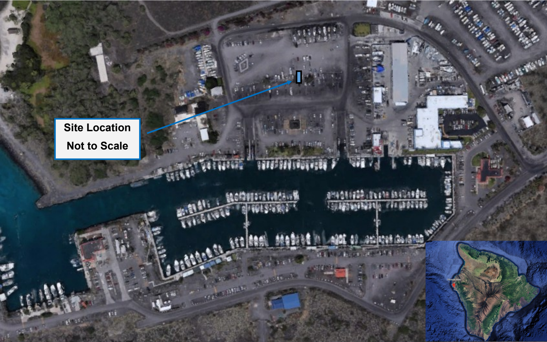
Exhibit A-1 Location of Food Truck Honokohau Small Boat Harbor