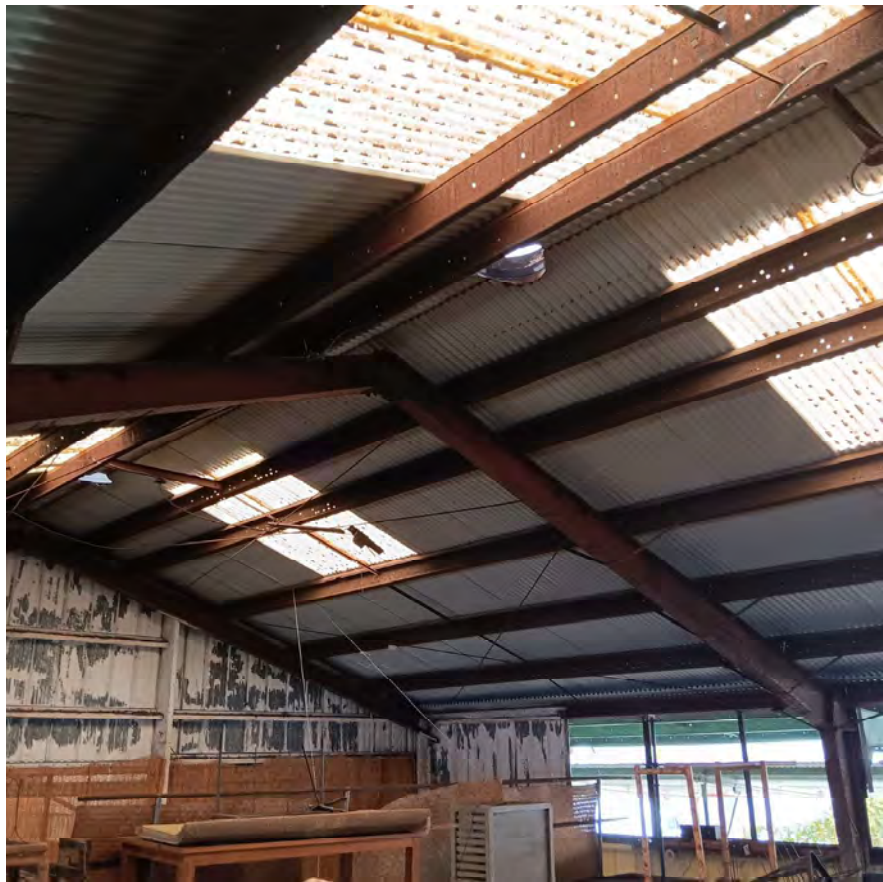
Open ceiling area