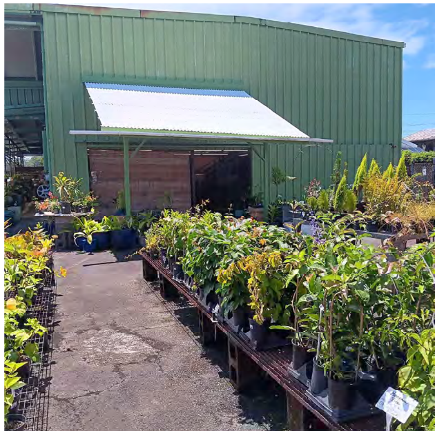
Rear of building