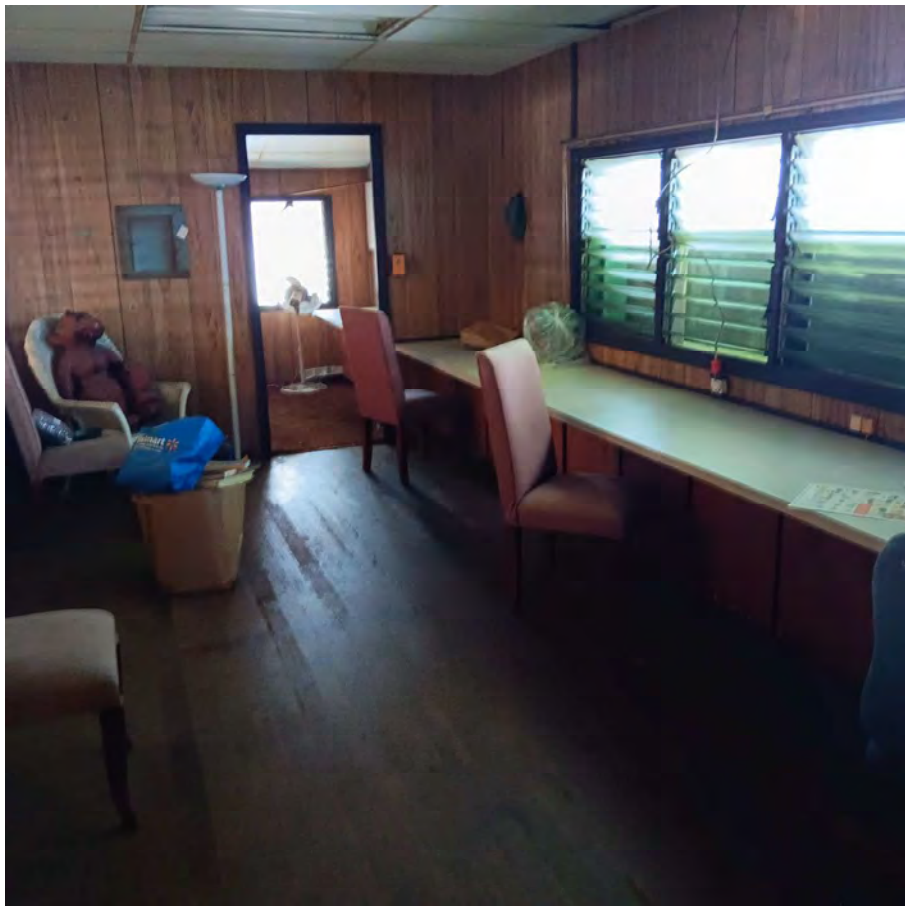
Upstairs office area