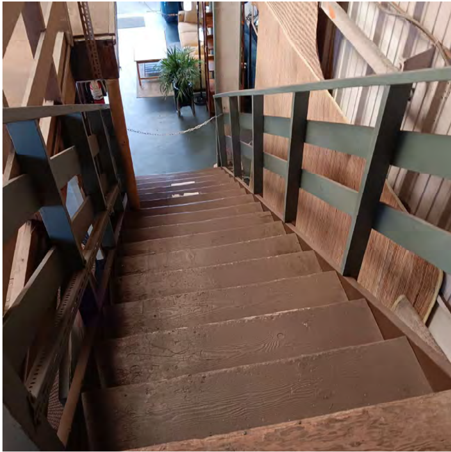
Stairs to second floor