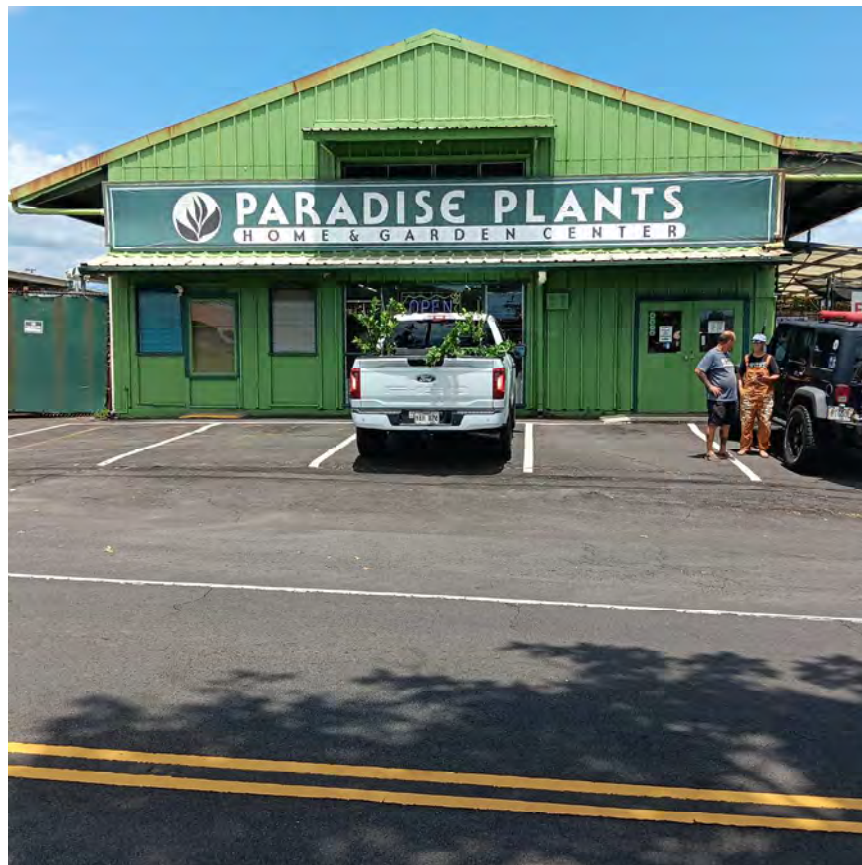
Front entrance area