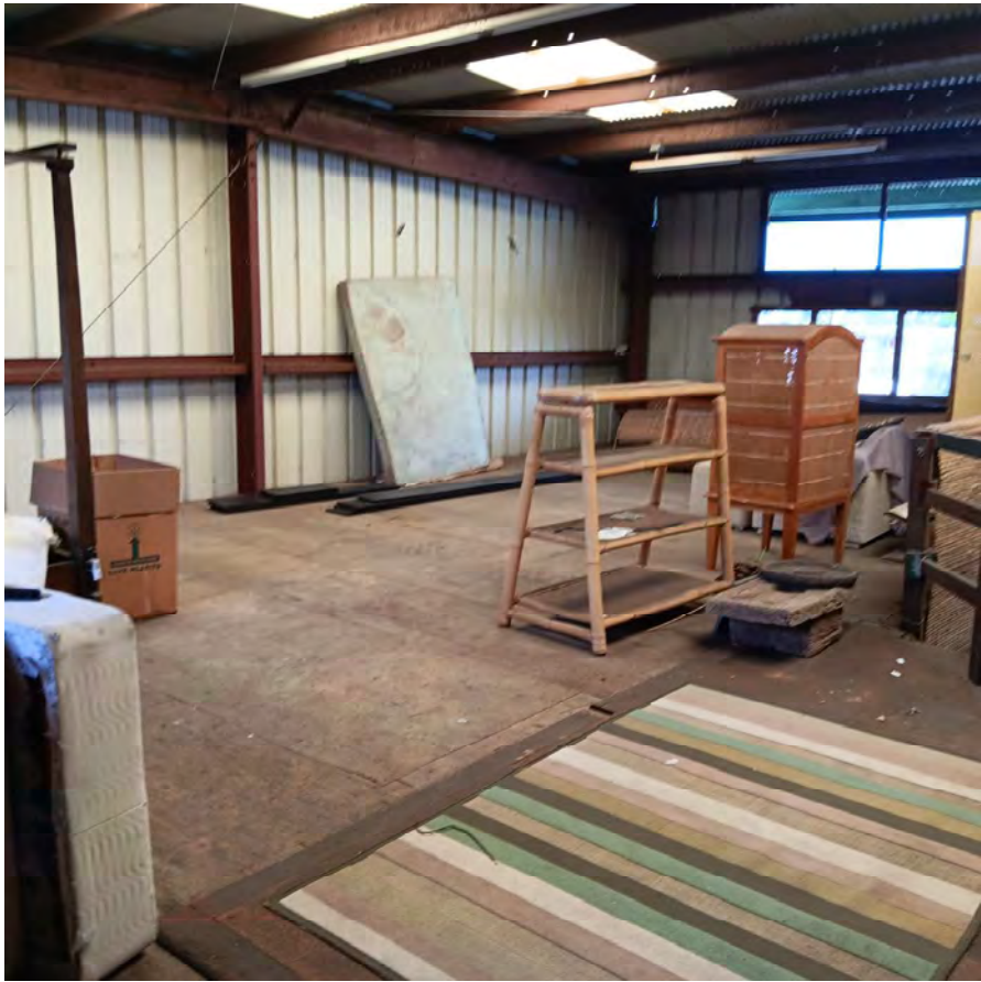
Upstairs storage area