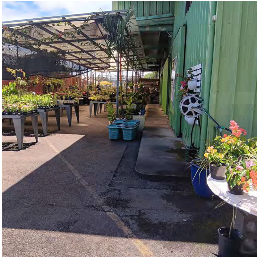
Eastern side of building